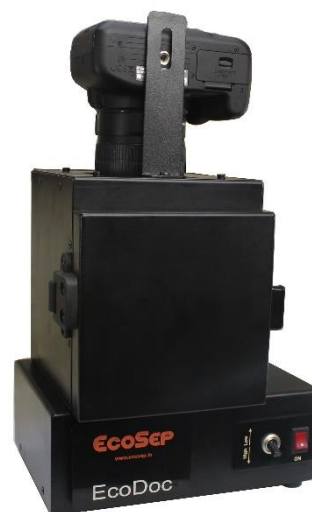
EcoDoc 2 (representational image)